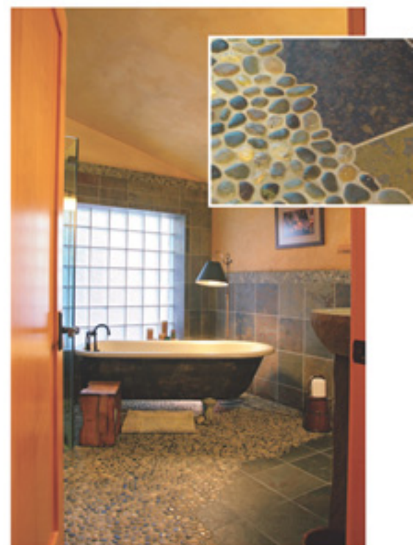
Pebble-beach bath. The interior designer specified two types of flooring, but it was the installer who conceived of integrating the two while watching waves wash over the sand during his lunch break at the beach. Photo taken at E on floor plan.