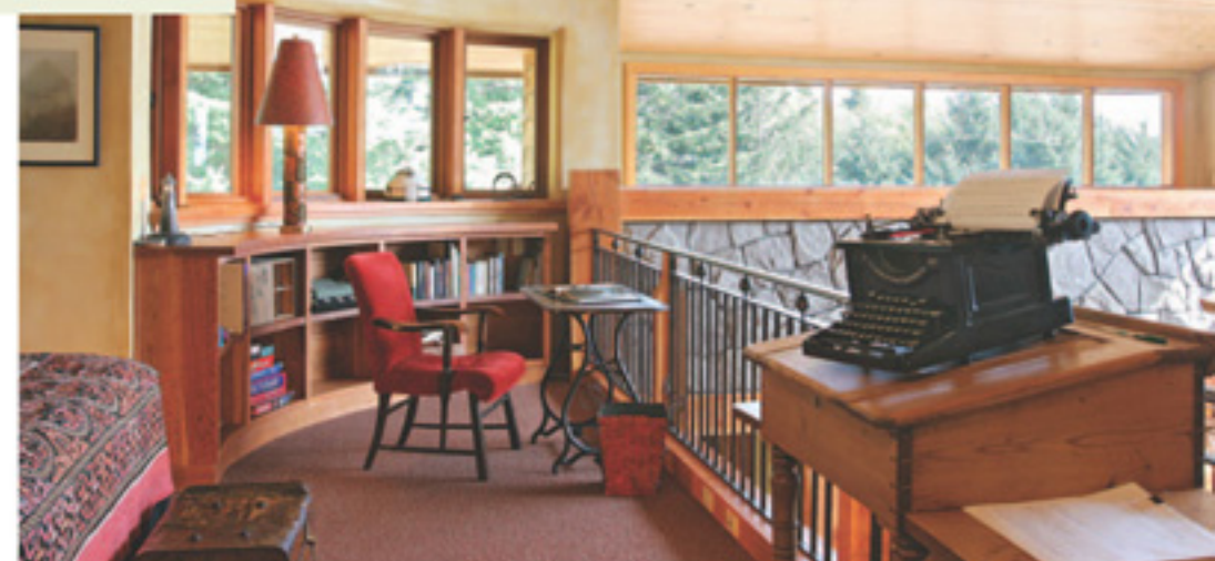
Natural daylighting is accomplished through a band of clerestory windows. A light-colored reflective ceiling and open floor plan allow light to penetrate deep into the house. Photo taken at D on floor plan.

Located on a south-facing slope below the house, the thermal collectors gather solar energy to heat water in a circulating loop. A heat exchanger transfers the heat from the loop to two 120-gal. storage tanks in the basement. These tanks provide hot water for the house. When the water-storage tanks are charged fully, excess heat is stored in the basalt-rock formations under the house for later extraction by a ground-source heat pump. Without the bedrock-storage loop, we